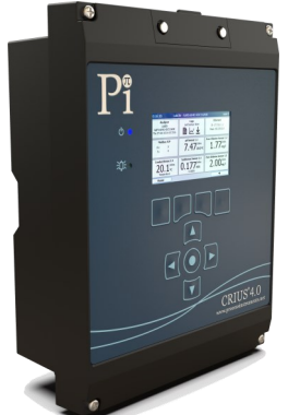
Pi's CRIUS® 4.0 Analyser

These two characteristics provide great benefits compared to a standard free chlorine sensor when the sensor is being used in an application where it is necessary to quickly and accurately measure the level of chlorine even after extended periods of exposure to chlorine-free water.