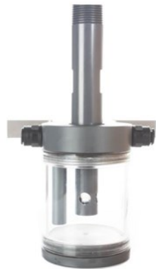
Single Closed Flow Cell