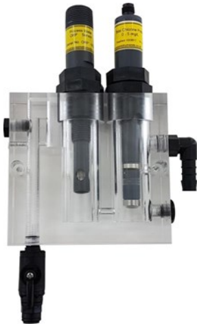
Double Open Flow Cell

4. Choose any flow cells or autoflushes that you might need for your sensors.